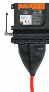
RECEIVER WITH CABLE PROTECTION JACKET